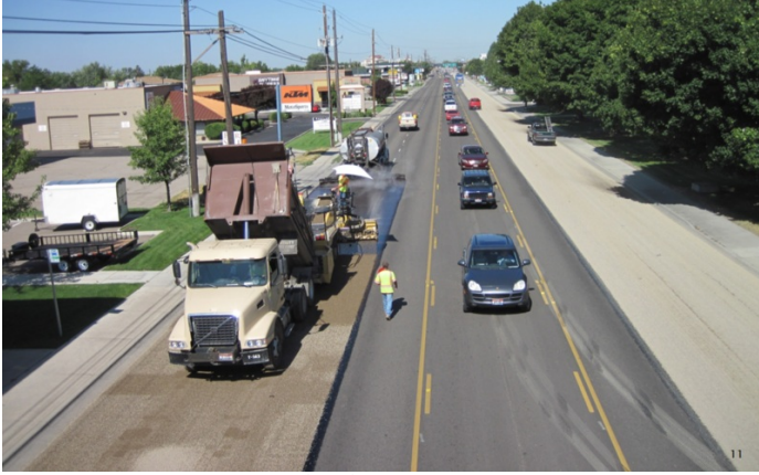
Chip Seal Process