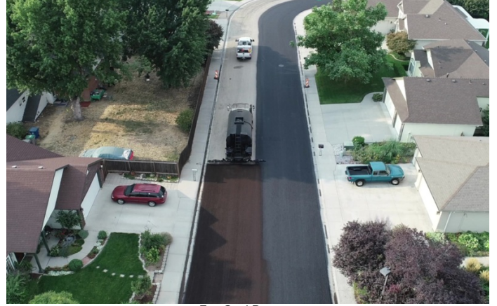
Fog Seal Process