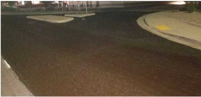
Micro Surfacing type iii aggregate