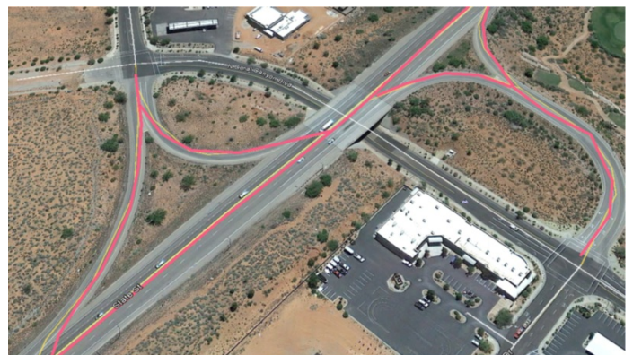
Ramps before construction