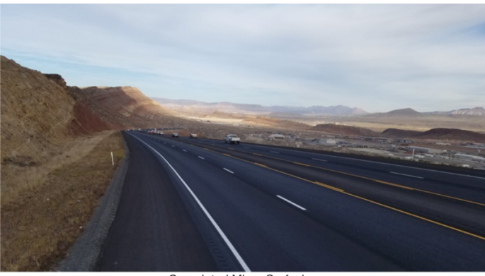
Completed Micro Surfacing