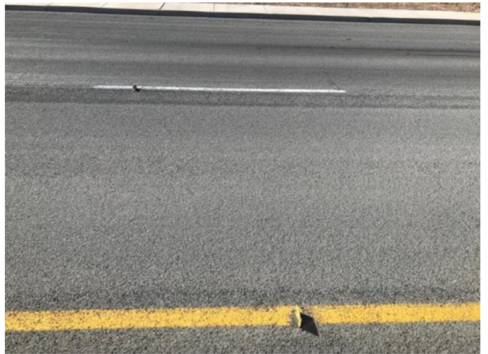
Completed Scrub Seal