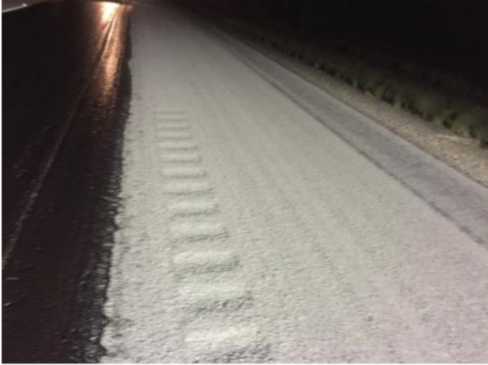
Scrub Seal night application