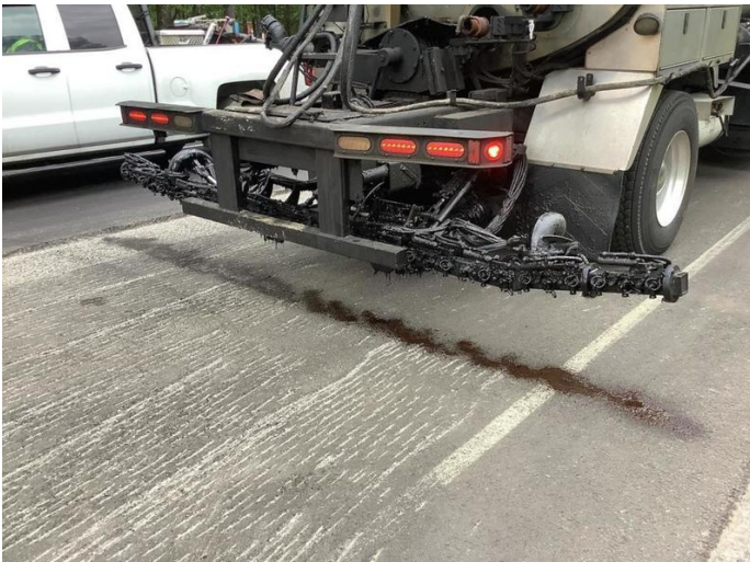
Prior to shooting trackless tack and checking each nozzle.