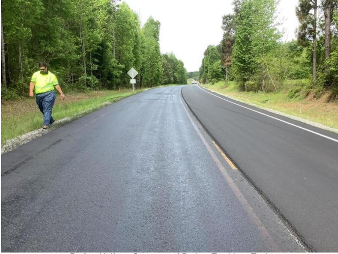
Perfect Uniform Coverage of Broken Trackless Tack