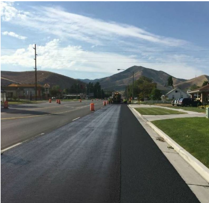
Micro Surfacing Application Intermountain Slurry Seal