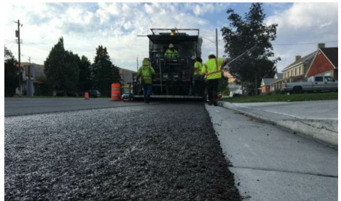
Micro Surfacing Application by Intermountain Slurry Seal with Bergkamp M1E Continuous Paver