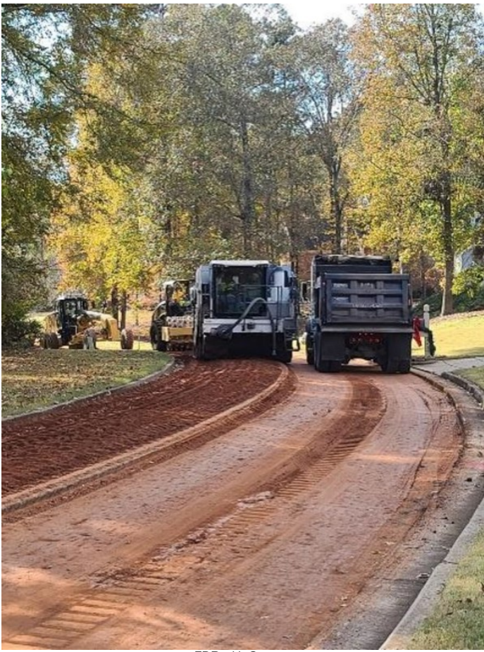
FDR with Cement