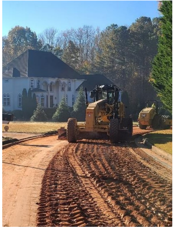
Compaction and final blading of FDR mix.