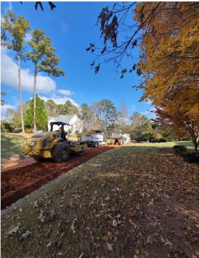
Performing FDR with Cement